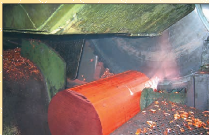
For Spray Misting

SCALE: Min/Nil=0 Low=1 Moderate=2 High=3 Extreme=4